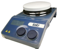
Stirrer pictured with protective cover