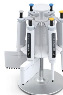
Ronda Stand 0020107134I