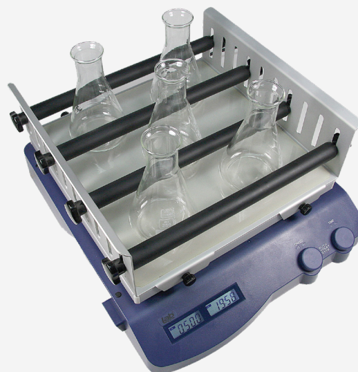
400.101.150 pictured with 400.101.157 attachment (not included in bonus offer)